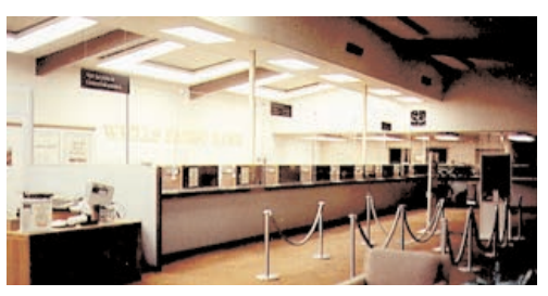
This photo shows a clear plastic barrier between employees and customers that can reduce occupational exposure to the general public.

negative pressure ventilation may be indicated.