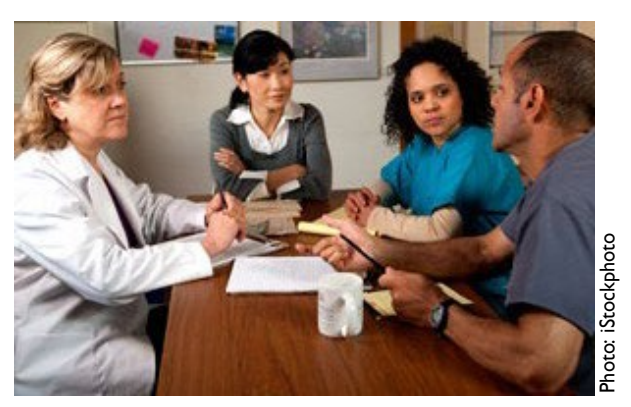
Healthcare personnel evaluating their RPP.

Any deficiencies in the implementation of policies and procedures that are discovered as a result of the evaluation must be corrected in a timely manner. In some cases, this might mean revising the written program to conform to actual practices as long as the procedures being followed comply with the standard. In other cases, it might mean retraining personnel on