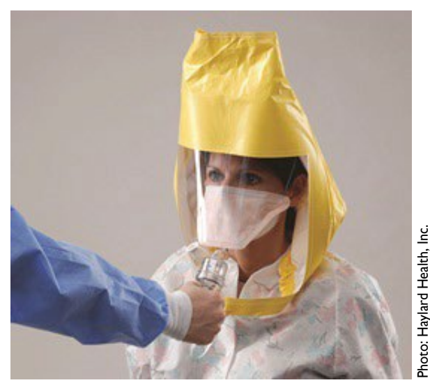
Worker receiving qualitative fit testing.

Describe your procedures for coordinating fit testing for your staff, as well as the specific, detailed fit testing protocol that will be used.