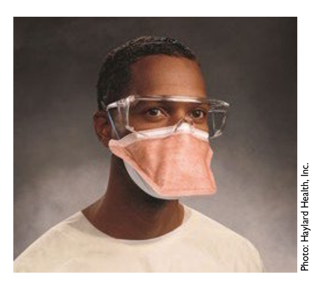
Worker wearing a filtering facepiece respirator and eye protection.

via the airborne route. However, for many other pathogens, there is less information available than for TB on how long they remain viable and infectious while airborne.