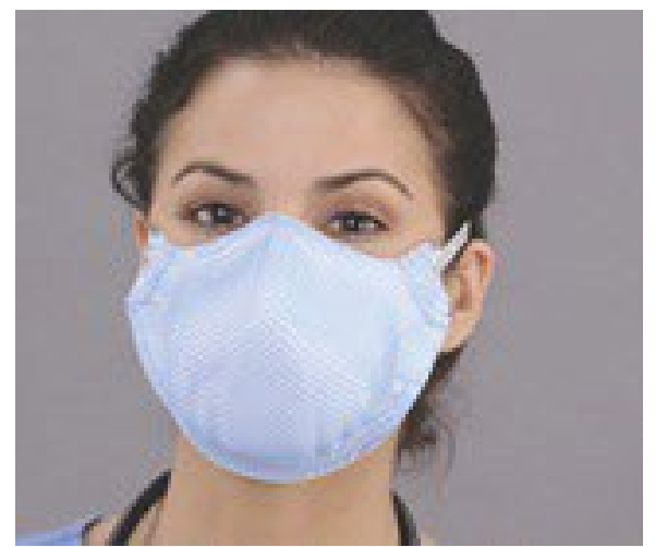
Worker wearing a filtering facepiece air-purifying respirator.

Powered air-purifying respirators (PAPRs) may be used in healthcare when aerosol-generating procedures are performed, by hospital first receivers, or when the respirator user is not able to wear a tight-fitting respirator. PAPRs have a battery-powered blower that forces air in the room through filters (for particles) or cartridges (for gases or vapors) to clean it before delivering it to the breathing zone of the wearer. High-efficiency (HE) filters are the