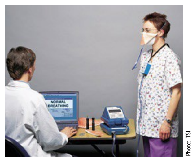
Worker receiving quantitative fit testing.

The OSHA Respiratory Protection standard Appendix A has specific protocols which must be followed exactly in fit testing employees for respirators, and it is acceptable to copy and paste one or more of these into your RPP. First, there are general requirements that pertain to selecting an appropriately sized respirator, some basic training on donning the respirator and performing a user seal check, and descriptions of the specific exercises that are to be performed