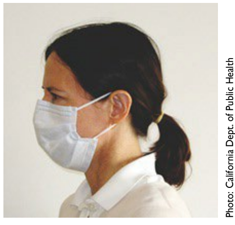
Healthcare personnel wearing a surgical mask.

Respirators are designed and regulated to provide a known level of protection when used within the context of a comprehensive and effective respiratory protection program (see the "Types of Respiratory Protection" section on page 15). For example, filtering facepiece respirators are designed to seal tightly to the face when the proper model and size is selected for the individual by using a fit test procedure. The wearer can then be assured that inhaled air is forced through the filtering material, which allows contaminants to be captured and reduces exposure to both large droplets and small infectious particles.