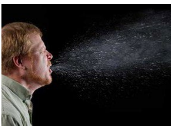
Airborne droplets visible during sneezing (photo enhanced).

Healthcare personnel who care for patients with ATDs must work in close proximity to the source of the hazard; even with controls in place, they are likely to have a higher risk of inhaling infectious aerosols (droplets and particles) than the general public. These personnel, and others with a higher risk of exposure related to the tasks they perform (e.g., lab or autopsy workers), must often be protected further through the proper use of