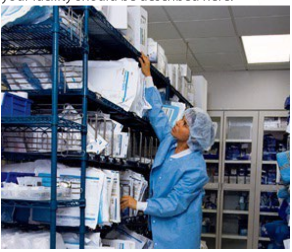
Healthcare personnel in a stockroom.

procedures will be done by the respiratory therapy department, the PAPRs will be stored there. Some hospitals issue PAPR hoods to individuals who are responsible for maintaining them, while central supply or materials management is responsible for decontaminating PAPR motors and blower units and charging batteries. Whatever you decide works best for your facility should be described here.