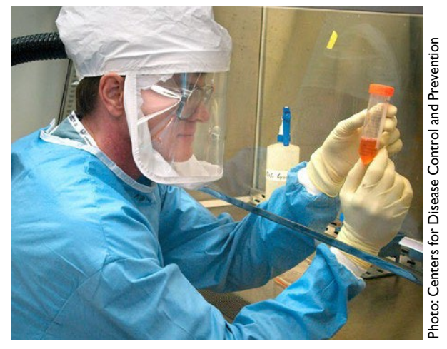
Laboratory worker wearing powered air-purifying respirator

Your written RPP should cover laboratory workers and specify the level of respiratory protection required for different pathogens or job tasks, in accord with the biosafety plan and other written lab operating procedures.