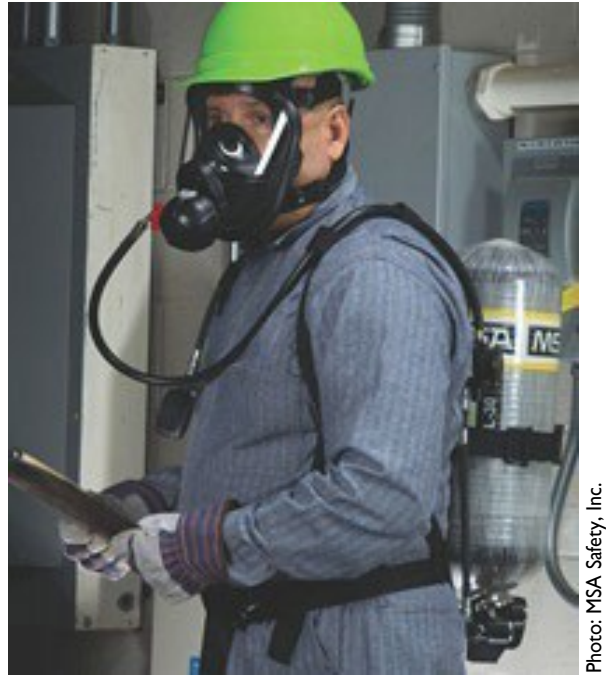
Worker wearing a self-contained breathing apparatus respirator.

See the "References, Resources, and Tools" section on page 36 for additional sources of information on respiratory protection.