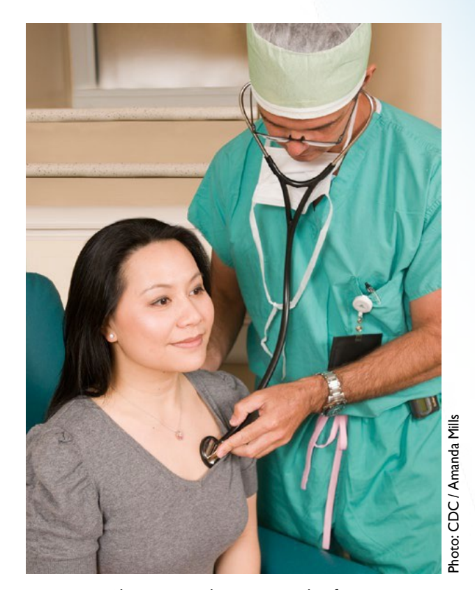
Physician evaluating a worker for respirator clearance.

Based on the answers to the questionnaire, as well as on a physical exam or any other tests the PLHCP deems necessary, the PLHCP must make a determination as to whether the individual can safely wear the respirator. Information that is useful for the medical evaluation of respirator