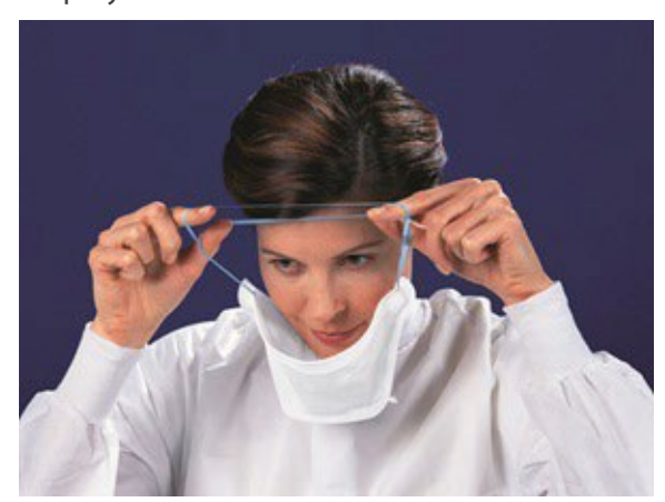
Worker donning a filtering facepiece respirator.

can cause an increased resistance to breathing or a build-up of carbon dioxide inside the facepiece. This can lead to medical complications in individuals for whom it may not be safe to wear a respirator. It may also be unsafe for someone with moderate to severe claustrophobia to wear a respirator. Medical evaluations must be provided by the employer during work time and at no cost to the employee.