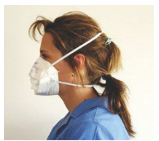
Healthcare personnel wearing a filtering facepiece respirator.