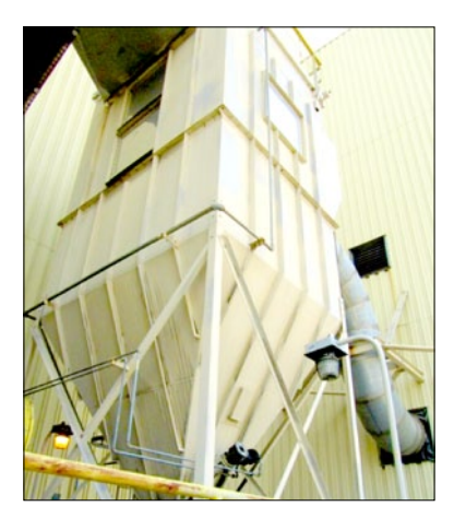
Figure 3. Dry baghouse

Dust-conveying air streams typically enter the top of a baghouse and then pass through groups of side-by-side bags that form a filter. Once the air passes through the bag filters, it is considered to be on the clean side of the baghouse. The dirty side is usually considered to be the lower part of the enclosure, which usually has sloped collection cones or pyramids to hold the dust as it falls out of the airstream and/or off the bags. The bags are held in metal frames suspended from a metal plate, often called a tube sheet. The bags and the metal plate form a physical separation between the dirty and clean sides. Generally, baghouses can collect smaller dust particles than other methods, because the bags forming the filter bank can be chosen to capture a particular size dust.