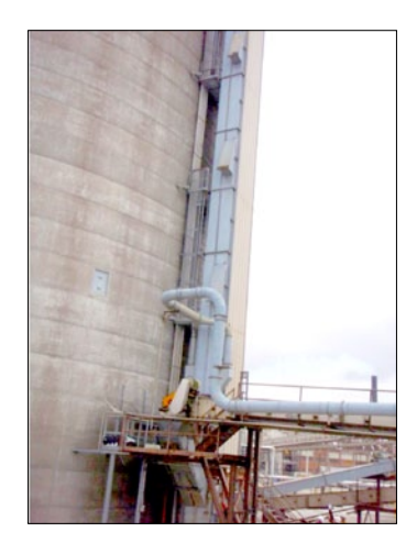
Figure 1. Bucket elevator and storage silo

Silos are filled from the top. Dust clouds are often generated during filling and can fill most of the ullage (unfilled) spaces. When filling ceases, the dust clouds typically settle onto the stored materials.