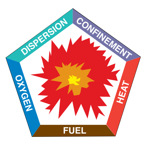
Figure 3. Explosion Pentagon

When a flash fire is confined, the pressure that develops can cause an explosion, damaging or destroying the confining enclosure (see figure 3). This explosion is a larger version of the lifting lid in the classroom demonstration above. The confining enclosure could be processing equipment, a conveyor, a dust collector, a room, or an entire building. The flying shrapnel, blast wave and collapsing structural members resulting from the explosion can injure or kill individuals over a large area.