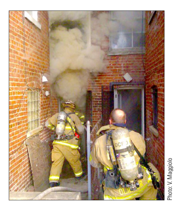
Figure 12. Firefighters performing an interior (offensive) fire attack

One of the first decisions during an emergency incident is whether to attack the fire offensively (see figure 12) or to contain it defensively; a rapid risk assessment must be conducted with the information available. This becomes more important during responses that involve materials subject to flash fires or explosions (including combustible dusts) because of the speed of the combustion and the large potential exposure areas.