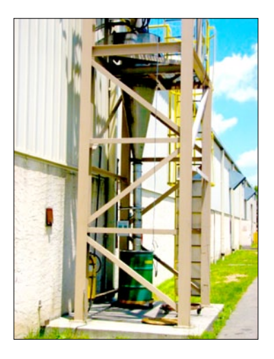
Figure 2. Cyclone dust collector

The dust-conveying air stream enters the cyclone unit and is sent into a circular motion, forcing the dust particles, especially the larger ones, to the inside perimeter of the unit. The particles then settle down the sides and collect at the bottom. The conveying air is discharged through baffles near the top or is ducted to a baghouse. The air is either sent for further processing or discharged from the building; it is unusual that air from a cyclone is returned to the building. Note whether the equipment is inside or outside the building.