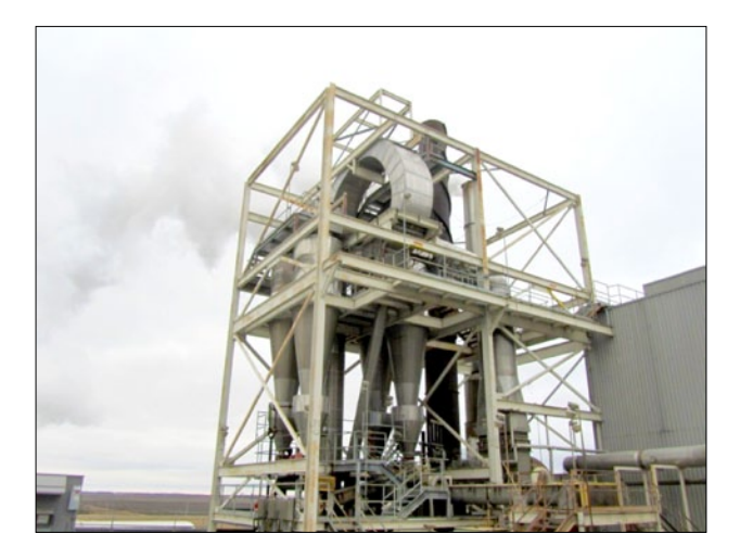
Figure 1. Ring dryer

Dryers and ovens are used to dry or heat materials as part of a process. They can be classified into two operational groups: continuous and batch.