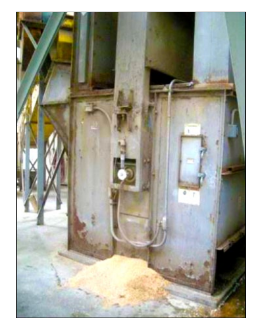
Figure 8. Sawdust spilled from equipment

A facility may produce, collect, or store dusts and/or dust-producing materials as its main operation or as an incidental matter. In either case, emergency responders need to know about combustible dust hazards in advance. This helps them plan appropriate actions and avoid creating additional hazards to themselves or occupants. All locations where combustible dust is used (including process or conveying equipment), produced (for example, cutting or grinding equipment), or stored (including all vessels, containers, or collectors) should be identified in the survey (see figure 8).