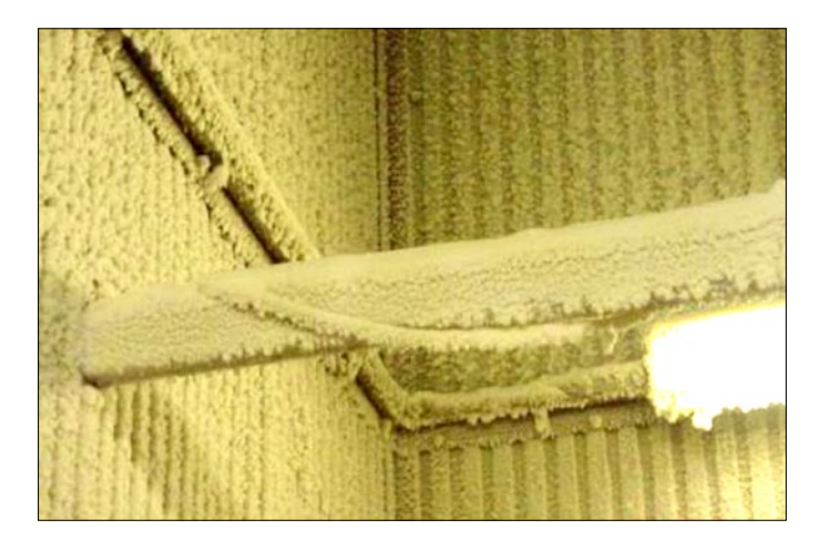
Figure 9. Sawdust clinging to horizontal and vertical surfaces

Combustible dust can accumulate on any upwardfacing surface. Fine dusts can even cling to vertical surfaces (see figure 9). A large amount of combustible dust often accumulates overhead, on structural components or other surfaces where it is hard to notice or clean. Historically, these dust accumulations are associated with cascading secondary explosions that lead to major or total facility loss. The team must consider all spaces both exposed and hidden and at any elevation—in the pre-incident survey.