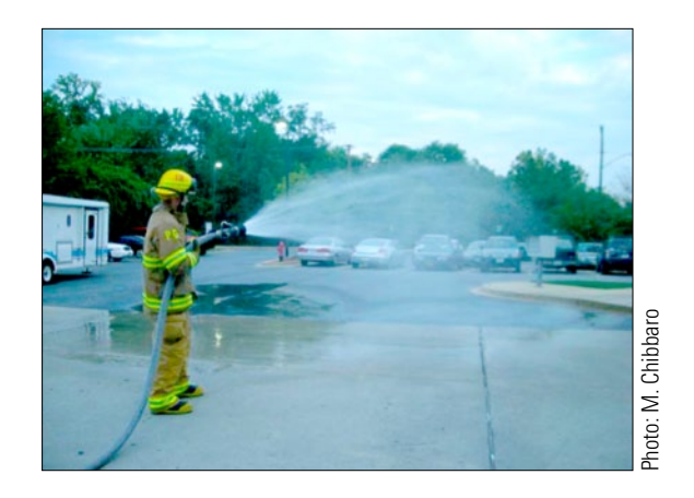
Figure 14. Low pressure, medium fog hose stream

The best way to apply water is in a medium to wide-pattern, as gently as possible (see figure 14). Responders should use a low nozzle pressure and loft the stream onto the burning material from as far away as the stream will reach.