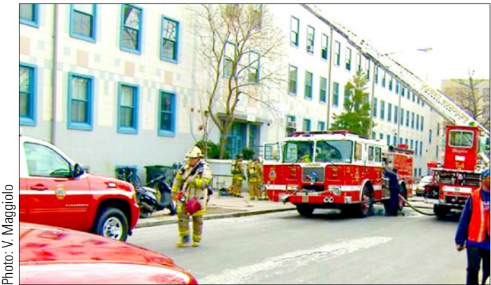
Figure 11. A fire department at the scene of a building fire

During an emergency response to a facility (see figure 11), the fire service and other responders can implement the IAP. SOPs or SOGs guide their general operations, as modified by the facilityspecific IAP. If an incident involves unexpected conditions, the IAP should be modified with the help of the information in the pre-incident survey and facility personnel. Together, planning and operational flexibility keep responders safe.