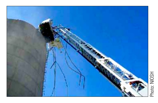
Figure 7. Wood chip silo explosion

Ohio, 2003: two firefighters killed, eight injured. According to a NIOSH report, several fire departments were fighting a fire at a lumber company in an oxygen-limiting silo that was filled with wood chips. Firefighters were directing water streams through openings at the base and the top of the silo when there was an explosion. A firefighter on top of the silo and another on an aerial platform were killed (see figure 7). The report cited improper tactics for oxygen-limiting silos as a factor in the outcome.