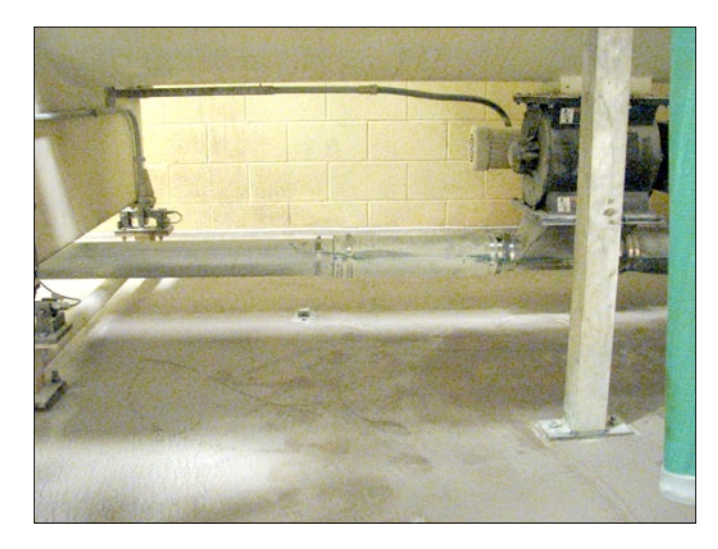
Figure 1. Conveying system piping

Industrial manufacturing facilities use many methods to move bulk solid materials through their production processes—for example, belt conveyors, screw conveyors and bucket elevators. Certain facilities use pneumatic conveyors to transfer materials; these are completely enclosed tubing, piping, or ductwork that can transport solids both vertically and horizontally. Pneumatic conveying systems can transport a wide range of materials, including process feedstock, finished products and even wastes collected in production areas.