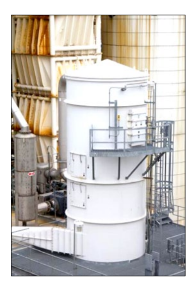
Figure 15. Access panel, walkway, and ladder on equipment

Dust collection systems (see Appendix A) typically use negative pressure; thereby collecting dust with exhaust hoods, sweeps, extraction points, and ducts. Rupturing or opening most ductwork for negative pressure systems while operating should not release much dust, but will likely reduce the air velocity and cause dust to accumulate within ducts. Every system is different, however, and the planning activities should consider the specific characteristics of the system in question. Note that dust collection baghouses and cyclones are especially likely to have significant accumulations of combustible dust, so emergency response activities involving these components should be well thought out.