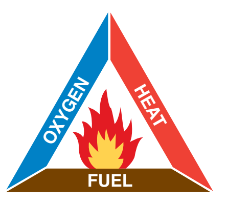
Figure 1. Fire Triangle

Firefighters are well aware of the elements of the "fire triangle": fuel, heat, and oxygen (see figure 1). In this case, combustible dust is the fuel. Oxygen is usually available in the ambient air. In addition to, or in place of the oxygen, another chemical oxidizer may simulate oxygen in the combustion reaction. The following information discusses the additional elements needed for a flash fire or explosion to occur.