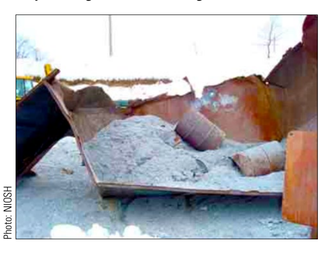
Figure 5. Dumpster explosion

Wisconsin, 2010: one firefighter killed and eight injured. According to a NIOSH report, foundry workers improperly placed a barrel of hot slag in a recycling dumpster with aluminum shavings, and a fire resulted. The local fire department had not conducted a proper preincident survey of the facility and was unaware of the incompatibility of water and burning metals. They attacked the fire with water first, and then foam. Despite making no progress toward extinguishing the fire, as well as visual warnings such as bluish-green flames, the firefighters continued to attack the fire at close range. An explosion killed one of them and injured eight others (see figure 5).