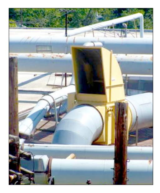
Figure 10. Abort gate in duct

of a confined area (see figure 10) and isolation devices that prevent damaging pressure or fire from extending to another piece of equipment. Facilities can use special high-speed detection and suppression systems as well as oxygen-reduction systems. The team should note all these devices and systems in the pre-incident survey; this will let emergency responders support the systems or avoid making them ineffective during an incident.