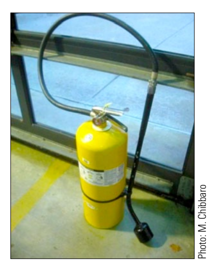
Figure 13. Class D fire extinguisher

The type and quantity of extinguishing agent must also be able to extinguish the materials involved in a fire. Examples include class C agents for live electrical equipment and class D agents for combustible metals (see figure 13).