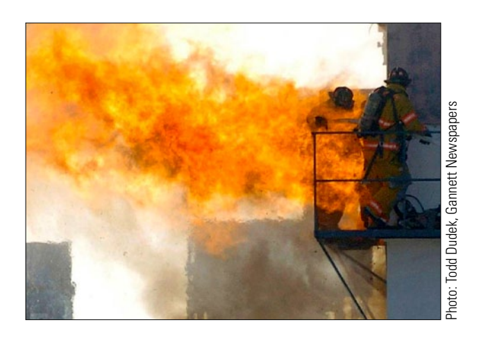
Figure 6. Sawdust hopper flash fire

from a sawdust hopper at a boat manufacturing plant. Two firefighters opened an access door and directed a straight stream of water onto the burning sawdust. A dust cloud discharged from the door, ignited immediately, and injured both firefighters (see figure 6 and cover). A second team of firefighters, unable to confer with the injured firefighters, repeated the attack using the same tactics. The same sequence of events recurred and they were also injured.