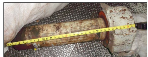
Figure 2: Portion of column separated from the main column in the incident. It is about 34 inches long and 7 inches in diameter.

Note: The described case was selected as being representative of improper work practices which likely contributed to a fatality from an incident. The incident prevention recommendations do not necessarily reflect the outcome of any legal aspects of this case. OSHA encourages your company or organization to duplicate and share this information.