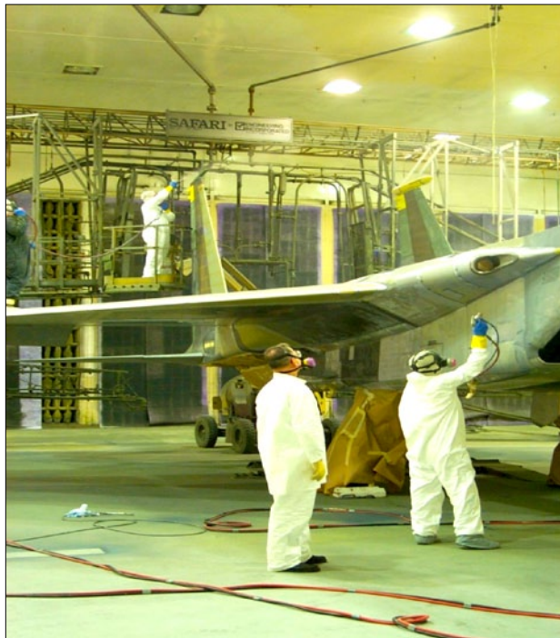
Spray painters applying a conversion coating treatment on the outside of an F15.

Certain paints and primers may contain Cr(VI), a cancer-causing compound regulated by OSHA. Exposure to Cr(VI) can occur during the painting of aircraft exteriors, interiors or parts, and during the removal of chromate-based coatings. Job tasks that may expose workers to Cr(VI) include spray painting, sanding, grinding and abrasive blasting.