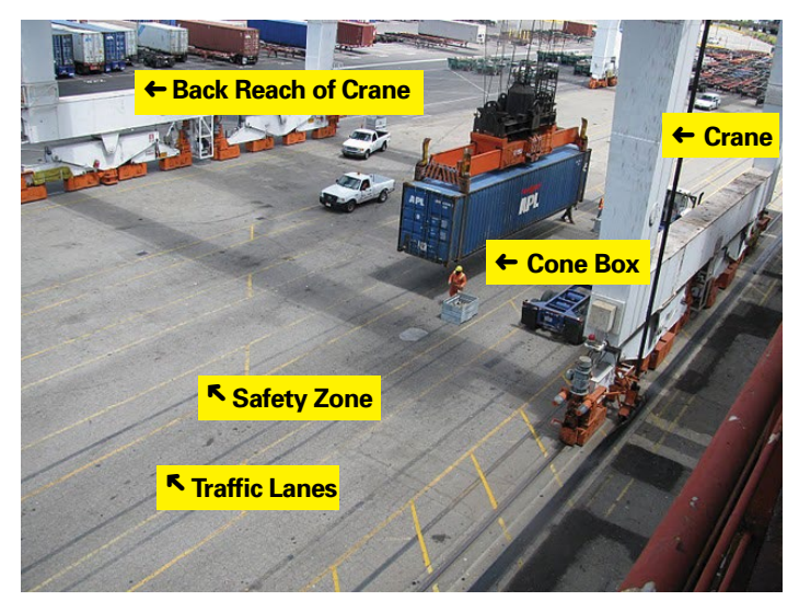
Striped traffic lanes and personnel safety zones under the crane.

For questions or to get information or advice, to report an emergency, fatality, inpatient hospitalization, amputation, or loss of an eye, or to file a confidential complaint, contact your nearest OSHA office, visit www.osha.gov or call OSHA at 1-800-321-OSHA (6742), TTY 1-877-889-5627.