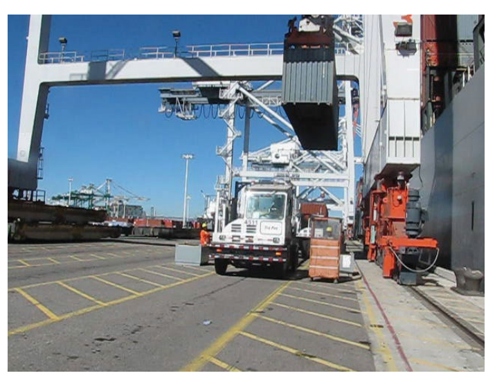
Striped lanes are personnel safety zones.