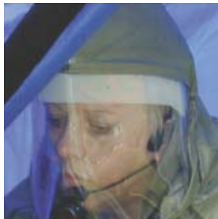
“Temple-transducer” style two-way radio headset stays in place under PAPER hoods.