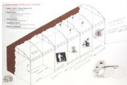
Visual aids help communicate to hospital managers the advantages and possible location of proposed permanent decontamination systems.

ed side; and (2) a pair of unused, canopy-covered ramps leading to one entrance of the ER (left from a period of construction when the ER was used as the main entrance to the hospital) is being converted into a permanent decontamination shower for ambulatory patients. When considering use of divided spaces, hospitals should determine whether the ventilation systems are also separate and whether they recirculate air. If a space becomes contaminated, it might be necessary to shut down the area's ventilation system to prevent circulation of contaminated air to other spaces.