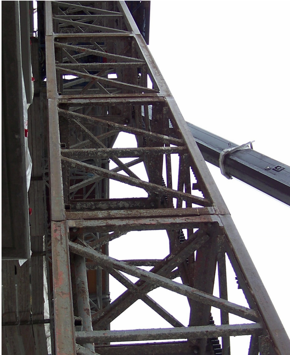
Figure 5 - Tower Mast showing non-uniform and rusted sections