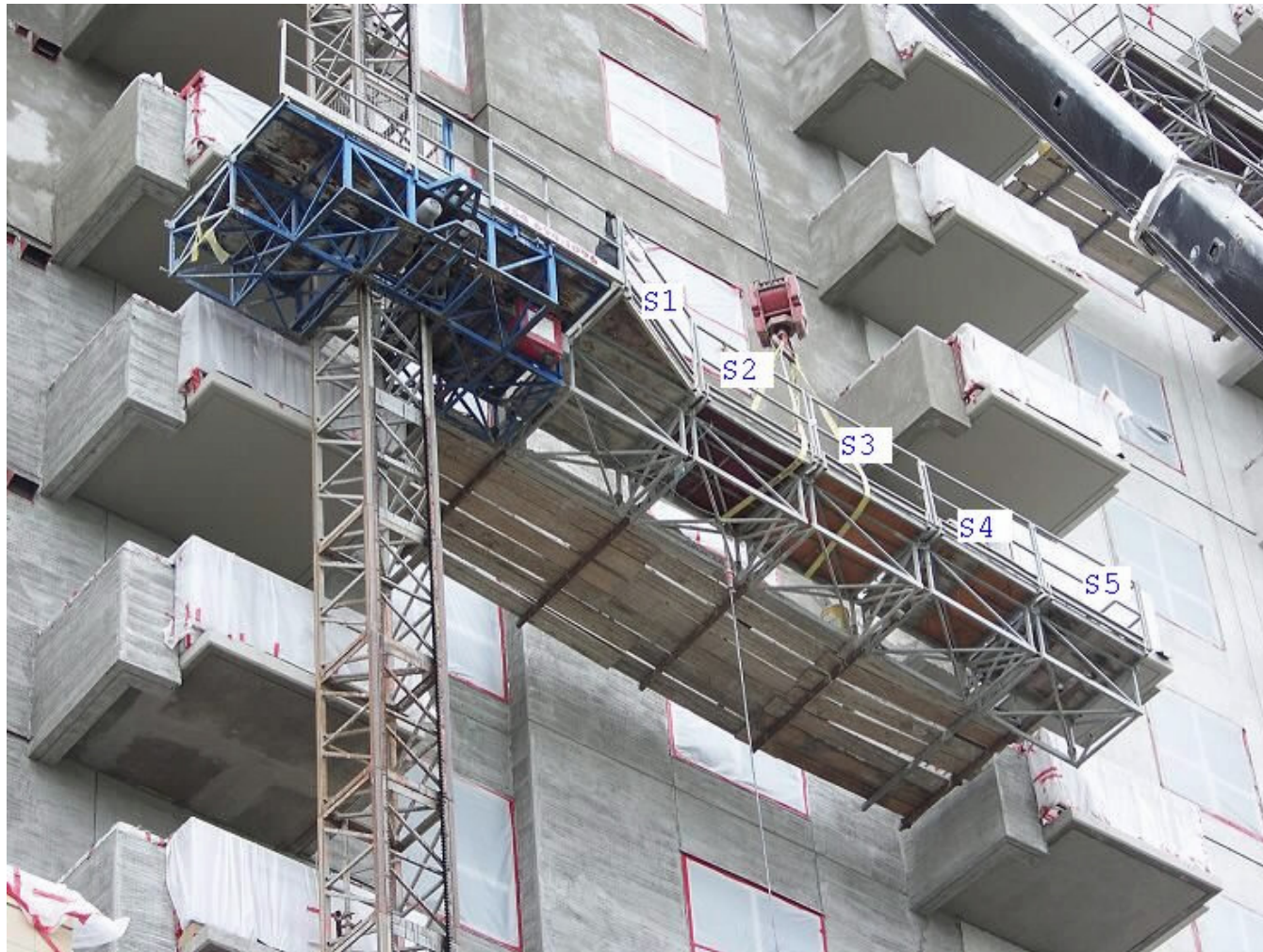
Figure 3 - Outriggers with seven walk board (south side deck modules shown)