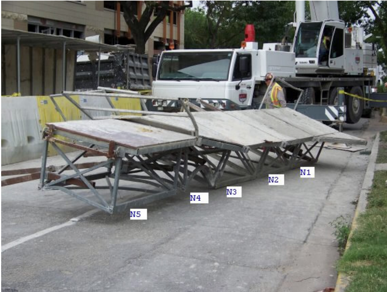
Figure 2 - Failed Deck Modules (North side)