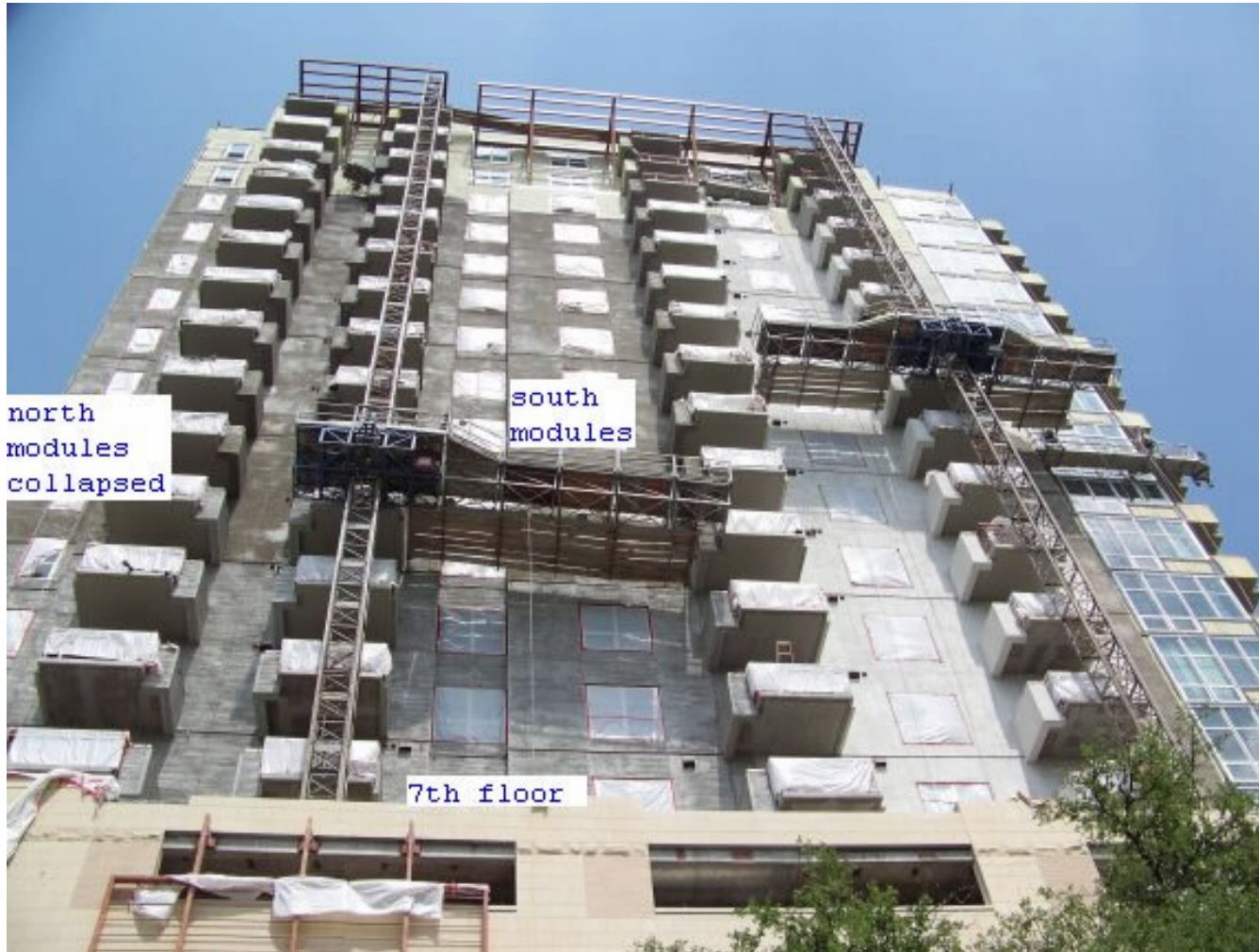
Figure 1 - Failed scaffold with north side modules separated.