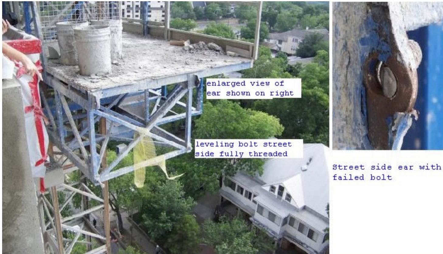
Figure 4 - Leveling Bolts and Ear on the Main Frame to which deck module #N1 was connected.