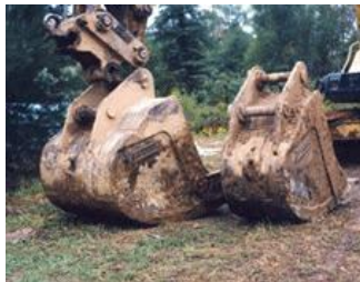
Photo: quick coupler and buckets