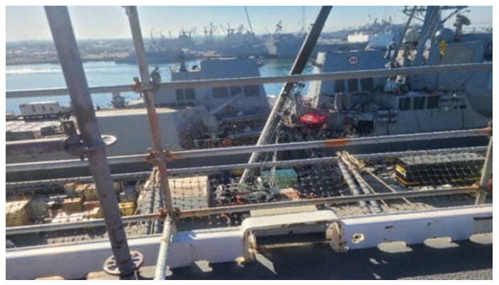
Image shows use of a guardrail at the deck's edge to prevent workers from falling to a lower level.

Edges of decks, platforms, flats, scaffolding, staging, runways, and similar flat surfaces that are more than 5 feet above a solid surface must be guarded with guardrails that meet the requirements of 29 CFR 1915.71(j)(1) and (2), unless the work being done or physical conditions prevent this (29 CFR 1915.73(d)).