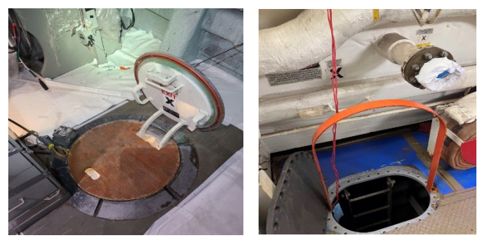
(Left) Image shows a hatch cover with adequate covering. (Right) Image shows appropriate use of a "U" bar to temporarily guard flush manholes during shipbuilding and ship repair operations.

Openings are hazardous when not protected. Hatches or other large openings that are not protected by coamings to a height of 24 inches, must be covered or guarded (e.g., guardrails) to a height of 36 to 42 inches (29 CFR 1915.73(c)). Flush manholes and other small openings must be covered or guarded at a height of 30 inches or more (29 CFR 1915.73(b)). Ensure that where covers are used, they are of suitable material, strength, and size to prevent workers from falling through the opening. It is also important that covers can't be unintentionally moved, such as through the use of cleats, or other methods.