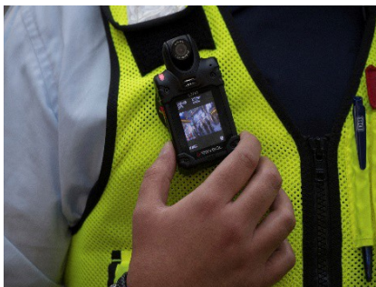
Image 2. Small wearable camera

Many consumer products have practical applications in small and large businesses. Ensuring these products will operate safely in workplaces begins with using batteries, chargers, and associated equipment that are tested in accordance with an appropriate test standard (e.g., UL 2054) and, where applicable, certified by a Nationally Recognized Testing Laboratory (NRTL) . 1 Manufacturer's instructions provide procedures for use, charging, and maintenance that is specific to each device and necessary to prevent damage to the lithium batteries (See Image 1). For example, some batteries will overcharge if a charger is used that does not turn off when the battery is fully charged.