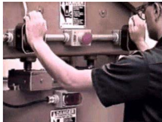
Mechanical power press operation using two hand controls

OSHA's Omaha, Nebraska Area Office investigated an amputation accident involving a guarded 60 ton, part revolution, mechanical power press. The press on which the amputation occurred incorporated a two hand control point of operation device and a PSD. The two hand controls were located 22 inches from the die area. The safety distance met the requirements in 29 CFR 1910.217(c)(3)(vii)(c) .